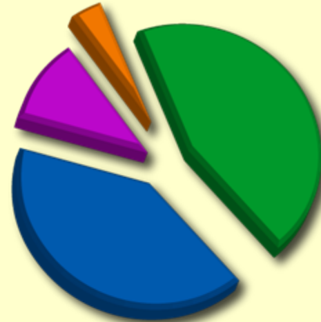
2003 - 6 months after graduation